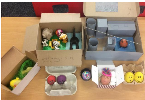
Kipling Class – We've had some egg-cellent Easter egg competition entrants. Well done Kipling Class! Enjoy your Easter break.