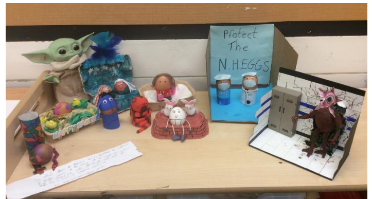
Pullman Class – Some egg-stremely good egg-stra mile work from Pullman class this week. All the entrants are egg-cellent! Some of these entrants terra-fried me! But it is wonderful how seriously the children took it and there was no yolk-ing around! Some of these eggs will be hard to 'beat'! Have a great Fry-day and an eggs-traordinary Easter holiday!