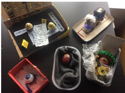
Cowell Class – a wonderful selection of 'eggs-tremely' impressive egg entries! Well done Cowell class – we hope you have an 'egg-cellent' Easter break!